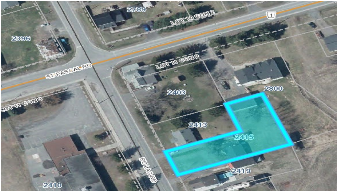
INCLUDES MATERIAL © 2024 OF THE KING'S PRINTER FOR ONTARIO. ALL RIGHTS RESERVED. | Produced by UCPR with data owned and/or used under Agreement with South Nation.