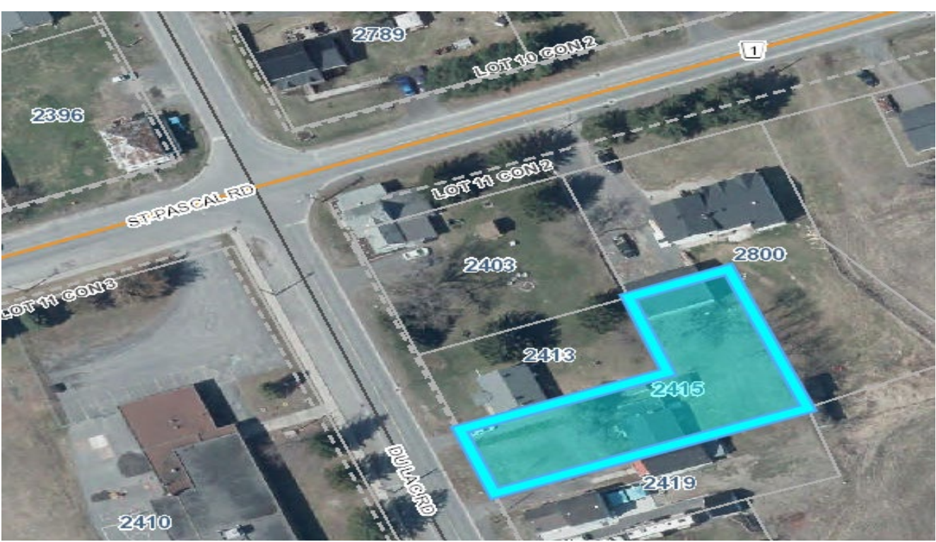
INCLUDES MATERIAL © 2024 OF THE KING'S PRINTER FOR ONTARIO. ALL RIGHTS RESERVED. | Produced by UCPR with data owned and/or used under Agreement with South Nation.

PT LT 11 CON 2 CLARENCE AS IN RR143185; CLARENCE-ROCKLAND