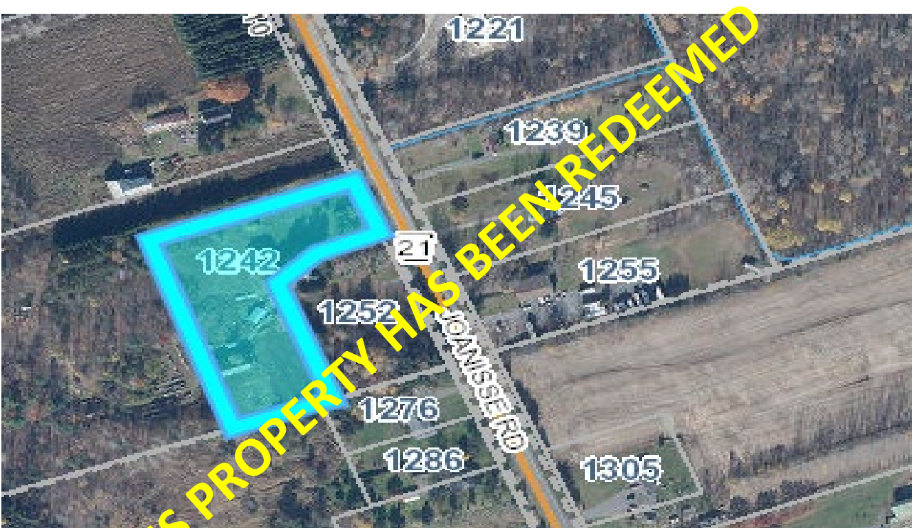
INCLUDES MATERIAL © 2024 OF THE KING'S PRINTER FOR ONTARIO. ALL RIGHTS RESERVED. | Produced by UCPR with data owned and/or used under Agreement with South Nation.

PT LT 2 CON 10 CLARENCE PT 3, 50R1092; CLARENCE-ROCKLAND